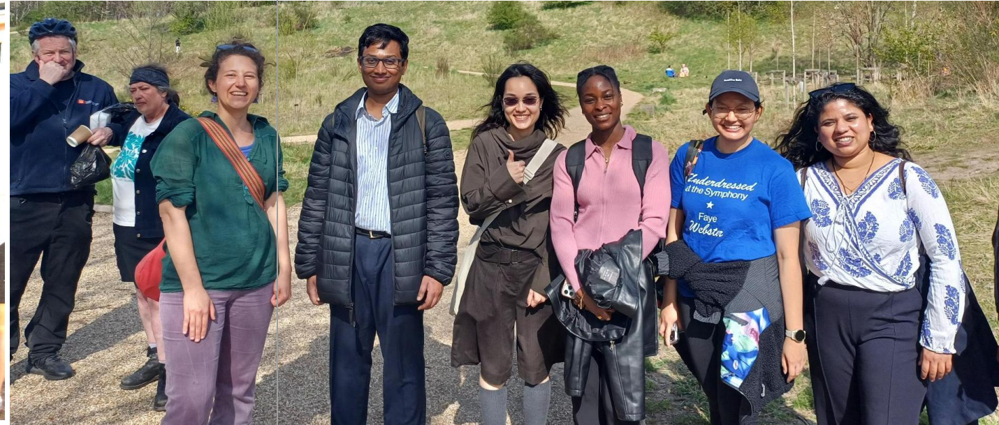
Right: EMEN Climate Ambassadors at an event at the Hamiltonhill Claypit.