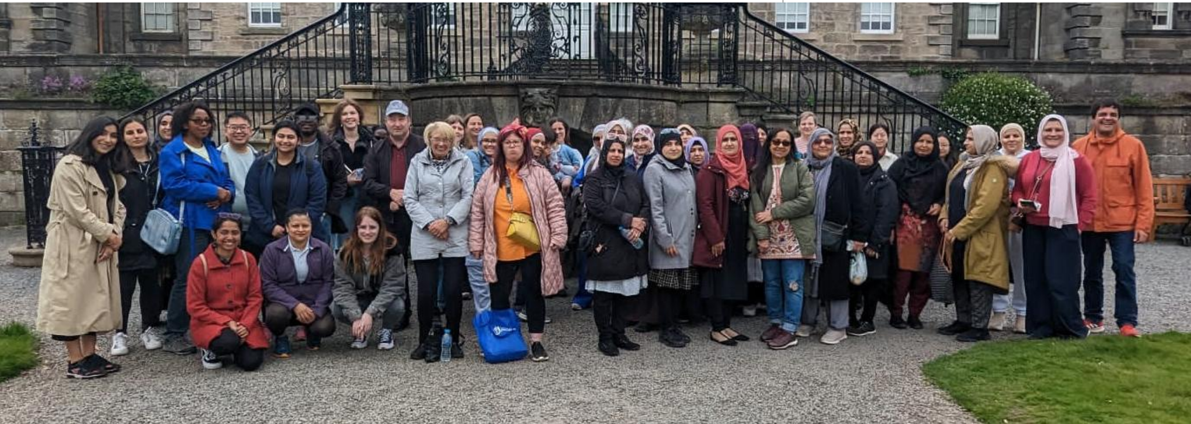
Left: EMEN Nature Walk at Pollok Park with network members and other participants.

Since 2024, more than 20 mainstream organisations, including university-led research projects, have worked with EMEN on topics ranging from citizen science, biodiversity, marine and wildlife conservation to nature connection. This has helped closed the gap between EM communities and mainstream organisations in Scotland.