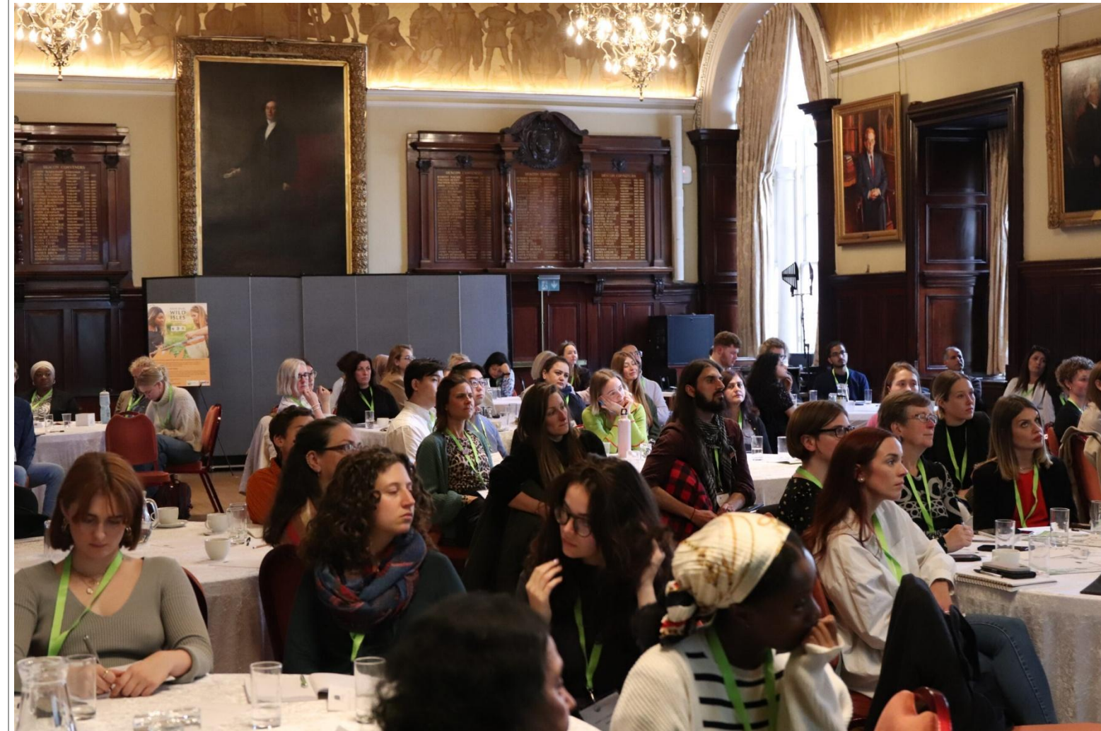
Above: Participants at the 2023 EMEN Conference.

A dedicated Network Support Team who ensures that you stay informed and connected with the network and helps you bolster your campaign strategies.